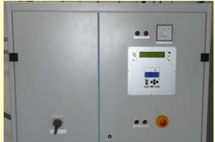
RPS Battery Test System

The RPS system is optimized for high power and high energy automotive systems, like HEV, PHEV, EV and SLI batteries and dlc.