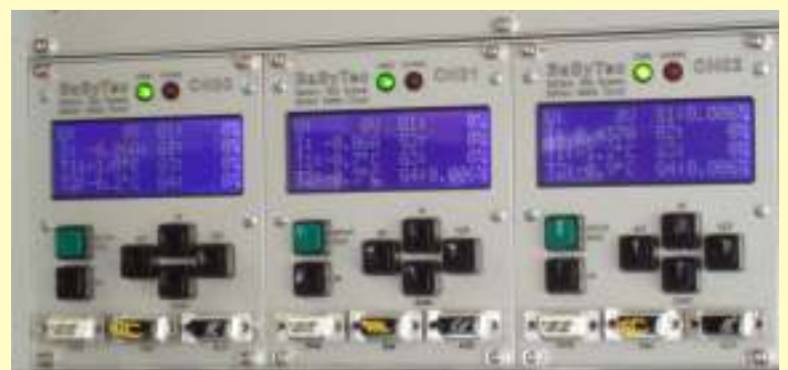
Battery safety devices