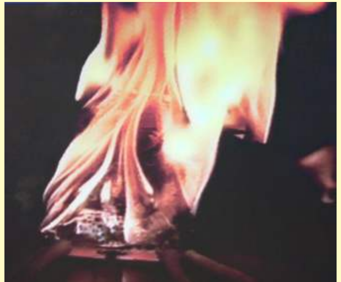
Fire caused by an overcharged battery

The BaSyTec Battery Safety Device (BSD) is an optional extension of the BaSyTec Battery Test Systems. It will independently monitor all critical parameters of the battery and its ambient and will switch off the battery current by locking the main output relay if any parameter exceeds its safe range.